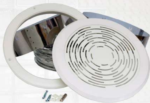
Ducting Kit includes Ceiling Trim, Venting Diffuser, Flexi-tube, Collars & Fixings.